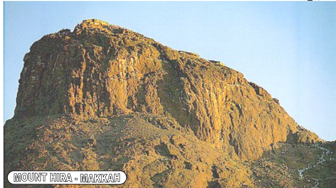
MOUNT HIRA - MAKKAH

Before Islam came, the people of Makkah would hate to have daughters. They were a very wicked people who would bury their daughters alive.